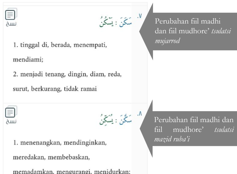
Figure 3: Examples of one of the mufrodat searches in the digital dictionary (Mu'jam al-Ma'ani). In addition to displaying the meaning of words, the digital dictionary also displays changes in the form of fiil madhi and fiil mudhore' in the tsulatsi mujarrod chapter.