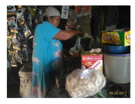
Image 1. Traditional cracker production majlis ta'lim Ar-Royyan members