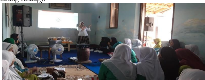
Figure 3. Marketing strategy training

2) Conducting training on marketing strategy to implement aspects to consider in the marketing strategy.