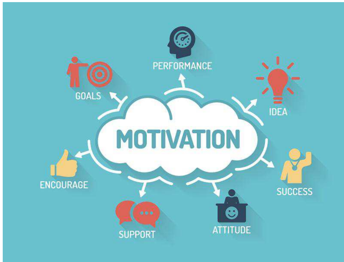
Figure 1. The results of Motivation (external and internal)

The characteristics of the curriculum 2013 use a scientific approach and recommend learning that actualizes the full potential of students and arouses motivation (Ahid et al., 2020). Learning models that are relevant to the demands of the curriculum 2013 one of which is ECIRR ( Elicit, Confront, Identify, Resolve, Reinforce ). One of the cooperative models that can be used to improve students' mathematical reasoning abilities and learning motivation is the learning model ECIRR ( Elicit, Confront, Identify, Resolve, Reinforce ). In addition to the learning model (Sumarni et al., 2019), motivation is also one of the causes of success or failure of learning (Sriwidiarti, 2016). If the motivation is strong enough he will decide to do learning activities (Yasin et al., 2020). Conversely, if the motivation is not strong enough he will decide not to carry out learning activities (Diani, et al., 2019), because motivation arises from within or from outside himself (Badrun & Hartono, 2013; Farhan & Retnawati, 2017; Supriadi et al., 2018).