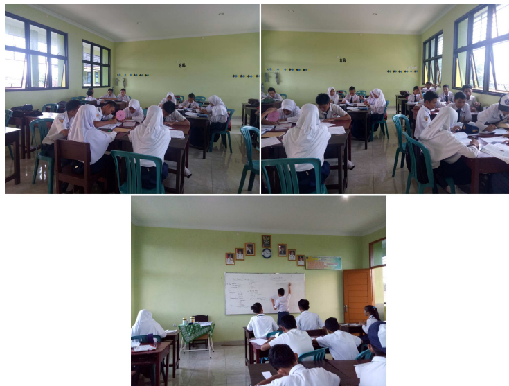
Figure 2. The condition of the class room (up : experiment class, bottom : control class)

The population of this study was all students in five classes XII Private School of Bandar Lampung in the odd semester of the 2018/2019 academic year. Samples were taken using the cluster sampling method and obtained class XII AP-2 and XII MM-1 as the experimental class, and class XII AP-1 and XII MM-2 as the control class.